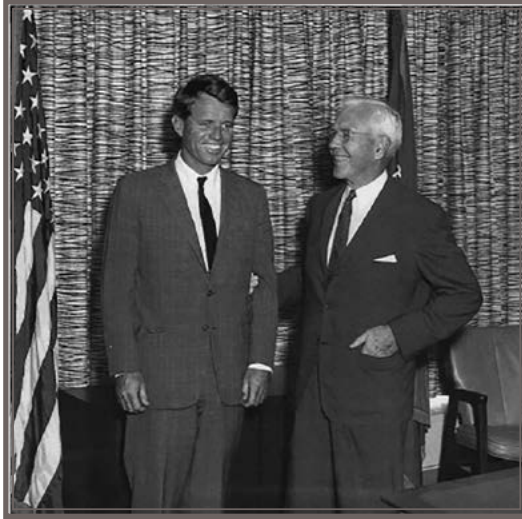
Attorney General Robert Kennedy and new DCI John McCone.

ber morning” that the international front was relatively peaceful and that there was nothing in the material McCone brought to him that required an immediate decision. 43