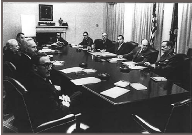
DCI Helms waits at the far end of the table to deliver his intelligence briefing to the NSC.

On one occasion the ambiguity about who was really speaking for whom was especially worrisome. A few days before the inauguration, Kissinger called Helms in Washington with a discouraging message. He said that the CIA director, following the inauguration, should brief the National Security Council on intelligence matters at the opening of its meetings but should then leave the meetings before the policy discussions. This scenario was represented by Kissinger as Nixon's idea, but Helms knew it was a ridiculous idea. Long experience had shown him that policymakers, during the course of their deliberations, frequently needed to turn to the representative of the Intelligence Community for factual updates.