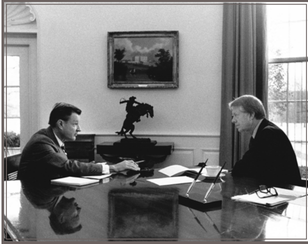
National Security Advisor Zbigniew Brzezinski and President Carter confer over the 21 January 1977 edition of the PDB..

the report and other developments relating to defense and foreign affairs. Often, while he was still present, I would call the Secretary of State or the Secretary of Defense on a secure telephone to obtain additional information or get their opinions. They, too, were early risers, always at their desks by seven o'clock. 25