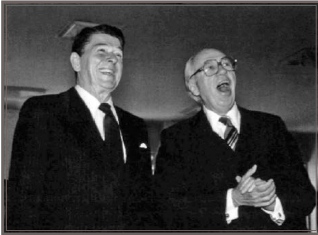
DCI William Casey's close relationship with Ronald Reagan during the campaign won him close and frequent access to the president.