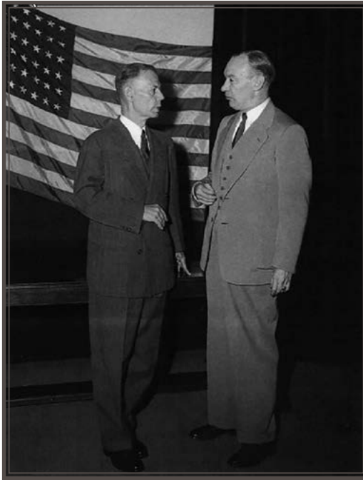
Gen. Walter Bedell Smith (left) relieves RAdm. Roscoe H. Hillenkoetter as Director of Central Intelligence in 1950.

years, saying that the CIA's global intelligence operations and procedures for forwarding information had made it possible to "keep the President informed better than ever before." In a rather backhanded compliment, Truman said he believed that "we have an intelligence information service now that I think is not inferior to any in the world." 2