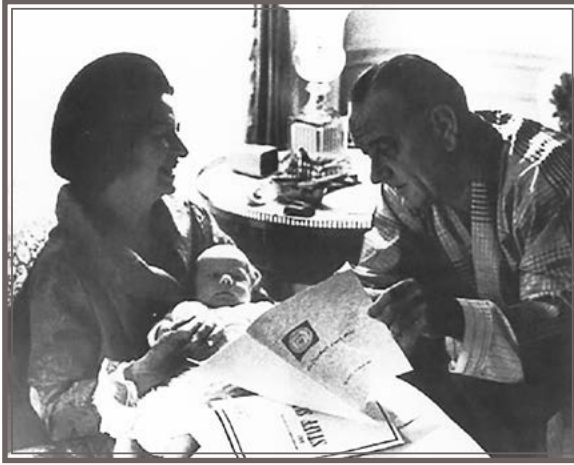
President and Mrs. Lyndon Johnson pose with their grandchild and a copy of the PDB.

son was holding their first grandson while the president was reading a copy of the President's Daily Brief .