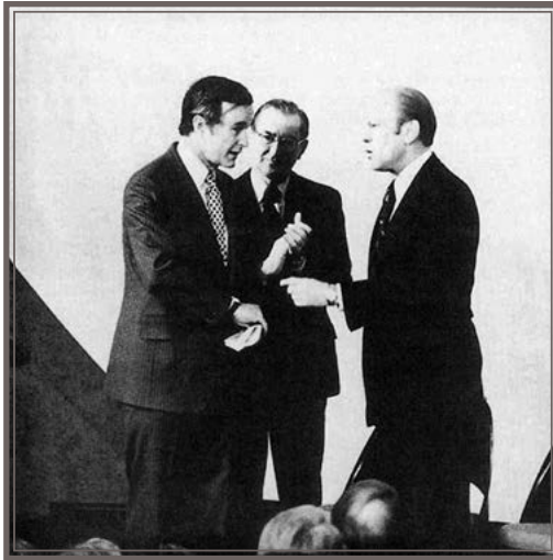
Former Ambassador George H. W. Bush receives congratulations from out-going DCI Colby and President Ford after his swearing in at the CIA Headquarters Auditorium.

Ironically, it would not be until Bush himself was in the Oval Office that CIA would again establish with a president a working relationship as fruitful as the one it had enjoyed during the first half of the Ford presidency.