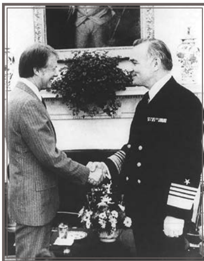
President Jimmy Carter welcomes DCI-designate Adm. Stansfield Turner to the Oval Office.

The DCI also used the occasion of the small group meeting to show the president-elect a copy of the President's Daily Brief . He described the distribution of the publication and informed Carter that President Ford had approved providing it to him on a daily basis starting immediately. This subject was to be discussed further in the larger briefing session.