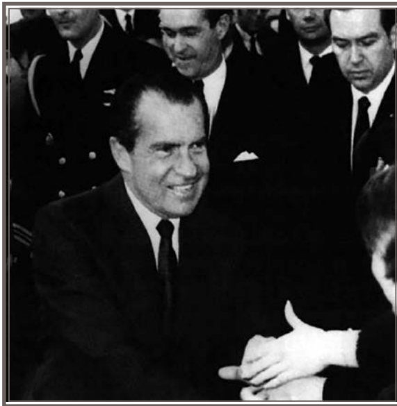
President Richard Nixon greets CIA employees as DCI Richard Helms looks on.

Czechoslovakia and the Soviet Union, events in the Middle East, and the military situation in Vietnam. 1 The director also discussed Cuba, including Castro's support for revolutionary efforts in Latin America, and events in the Dominican Republic and Haiti. Following Helms's briefing, Vance continued with a review of developments in the Paris peace negotiations that included details of the private talks under way between the United States and North Vietnam.