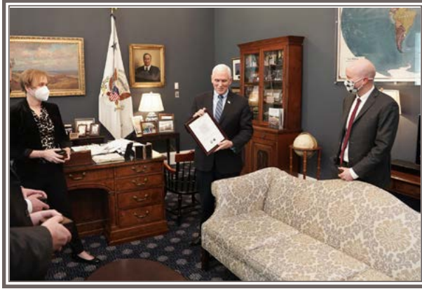
Vice President Pence was a regular reader of the PDB. He invited his PDB briefers to his home near the end of the Trump administration and presented commemorative medallions to them. The team, in turn, offered the vice president a certificate of appreciation of his own.

scheduled after the attack on the Capitol. 35