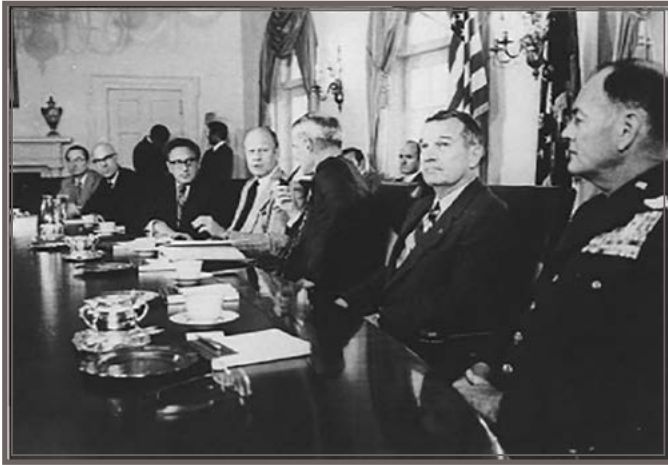
President Gerald Ford, flanked by Secretary of State Kissinger and Defense Secretary Schlesinger, presides over an NSC meeting. DCI Colby is seated at the far left.

ings in Chile. As the Rockefeller Commission and the Church and Pike Committees exposed more and more information about the Agency's real and imagined misdeeds, the director's standing with Ford weakened. Colby was not responsible for the sins of the past and, in fact, had ordered some controversial programs halted, but his handling of the issues—in particular, his failure to forewarn the White House of breaking embarrassments—caused Ford and Kissinger to lose confidence in him.